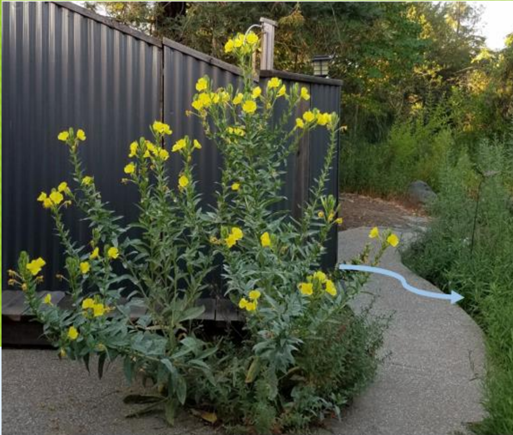
Shower drain is piped under walkway to Rain Garden which contains a Willow plus native plants that can tolerate winter flooding.

Rain Garden : a garden that lies below the level of its surroundings, designed to absorb rainwater that runs off of a surface such as a patio or roof