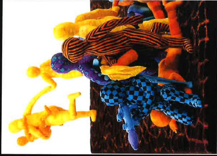
SUSAN ELSE fiber sculpture

GALLERY AT 48 NATOMA January 27 to April 6, 2023