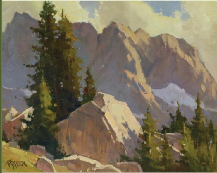
From Out of the Rocks , by Paul Kratter oil painting