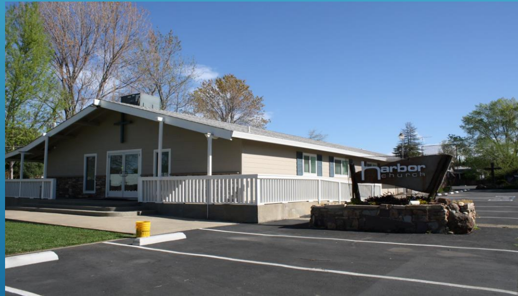
SHELTER SITES – MUSLIM COMMUNITY OF FOLSOM, THE GATHERING PLACE, HARBOR CHURCH