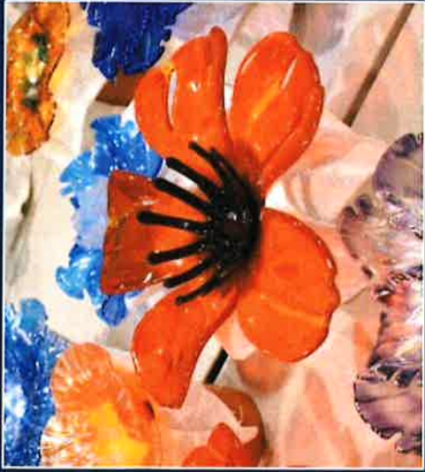
KATIE SHULTE JOUNG glass