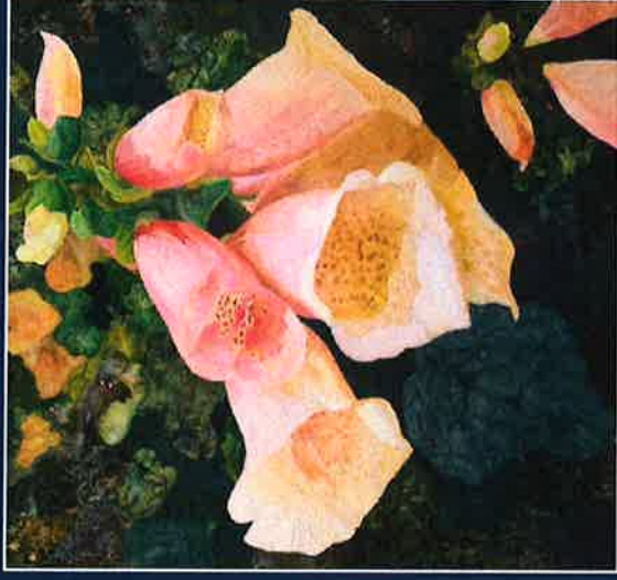
SANDRA MOLLON textiles