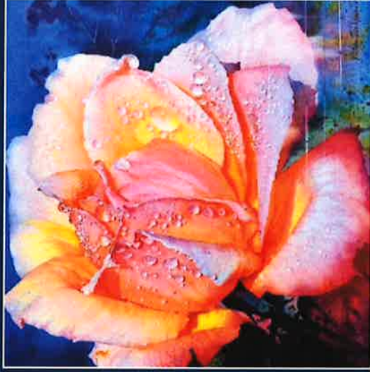
NATALY TIKHOMIROV watercolors

GALLERY AT 48 NATOMA September 8 to November 8, 2023