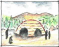
FIRST NATION DWELLING