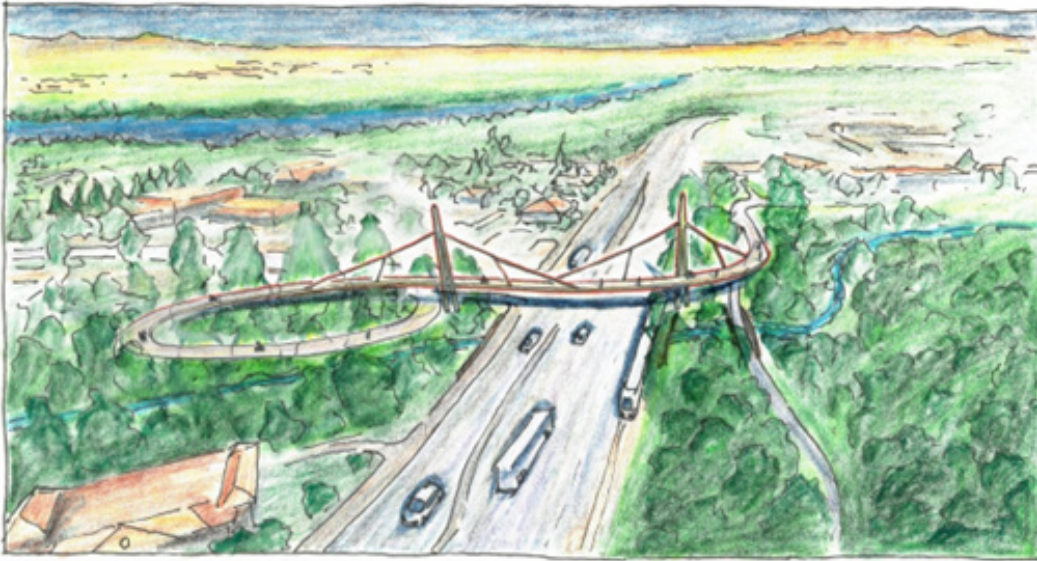
DESIGN CONCEPT 1