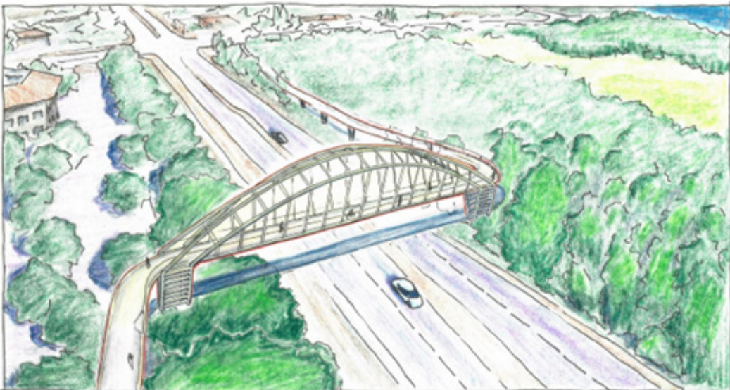
DESIGN CONCEPT 2