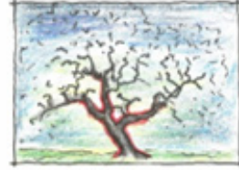
LIVE OAK, NOTE BRANCHING PATTERN