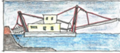
GOLD MINING BARGE, NOTE ANGLED TOWERS AND FORKED CABLE SUPPORTS