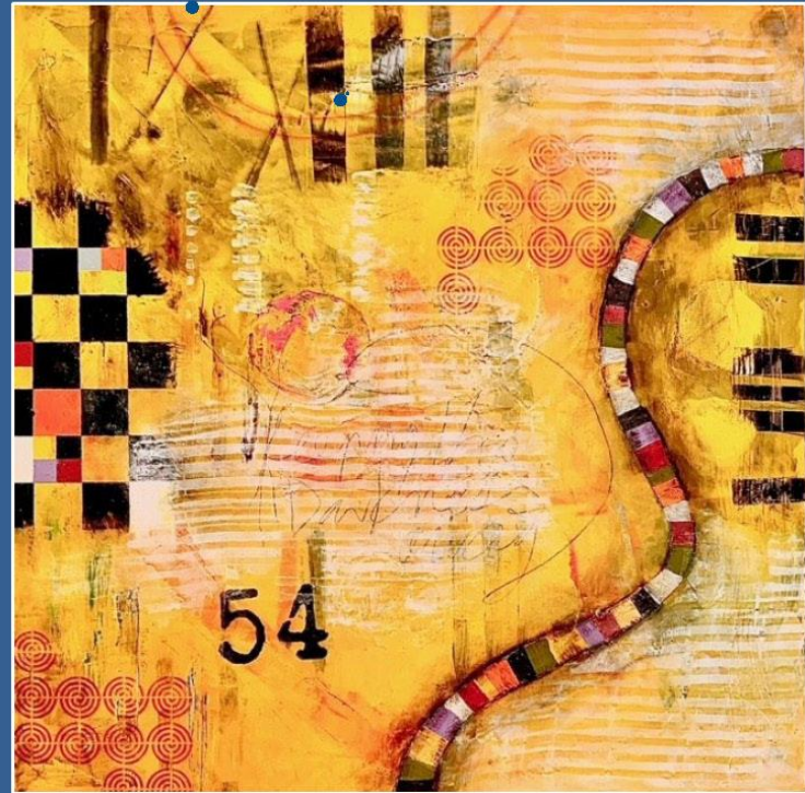
LINDA NUNES oil, mixed media

ABSTRACT IDEAS GALLERY AT 48 NATOMA February 16 to April 18, 2024