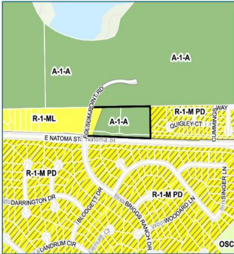
Existing Zoning Designation