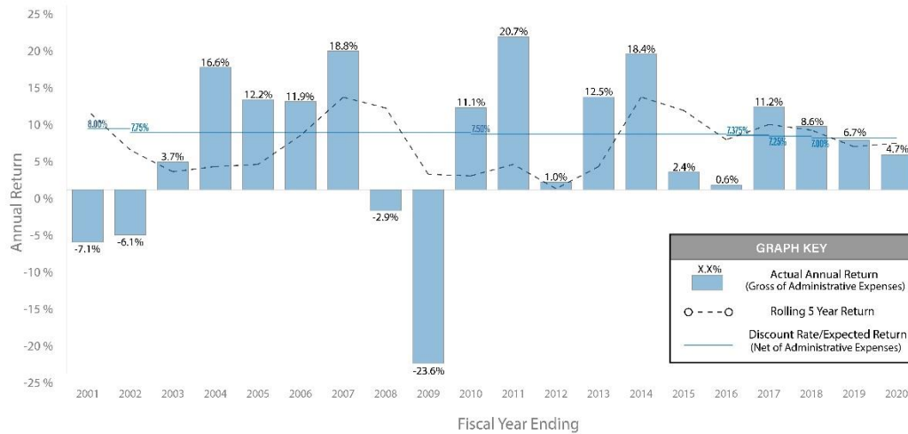
History of Investment Returns (2001 - 2020)

The table below shows annualized investment returns of the PERF for various time periods ending on June 30, 2020 (figures reported are net of investment expenses and gross of administrative expenses). These returns are the annual rates that if compounded over the indicated number of years would equate to the actual performance of the PERF. It should be recognized that in any given year the rate of return is volatile. The portfolio has an expected volatility of 11.4% per year based on the most recent Asset Liability Modeling study. The realized volatility is a measure of the risk of the portfolio expressed as the standard deviation of the fund's total monthly return distribution, expressed as an annual percentage. Due to their volatile nature, when looking at investment returns, it is more instructive to look at returns over longer time horizons.