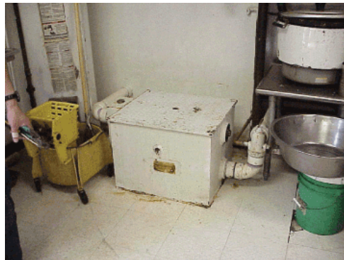
Manual Grease Trap