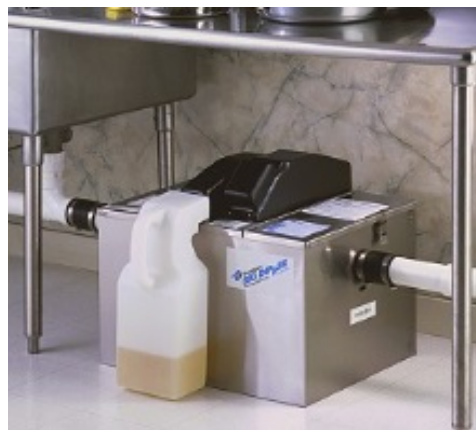
Automatic Grease Trap